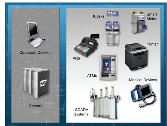
Figure 1. In addition to desktops and servers, McAfee Application Control software extends protection to fixed-function devices to significantly reduce consumer risk.

McAfee ePO software consolidates and centralizes management, providing a global view of enterprise security—without blind spots. This award-winning platform integrates McAfee Application Control software with McAfee Risk Advisor, McAfee Host Intrusion Prevention, McAfee Firewall, and other McAfee security and risk management products. In addition, McAfee ePO software can easily embrace products from McAfee Security Innovation Alliance Partners, as well as your home-grown management applications.