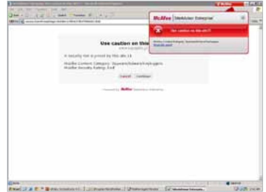
Figure 3. McAfee SiteAdvisor Enterprise blocks access to unwanted websites based on custom blacklists and whitelists.

McAfee Web Filtering for Endpoint is an optional add-on to McAfee SiteAdvisor